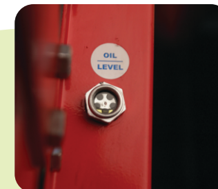
Visual Oil Level Indicator on Side Transmission.