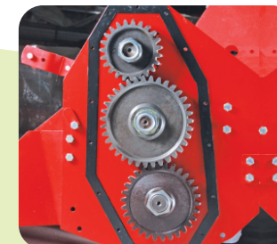
Heavy Duty Side Transmission Gear Drive.